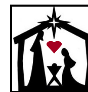
Table Hostesses Needed for Advent by Candlelight

The Lutheran Girl Pioneers will once again this year host Advent by Candlelight on Sunday, November 29 at 1 pm. Advent by Candlelight is a ladies-only event held the first Sunday in Advent. It's purpose to remind us of the reason for the season!