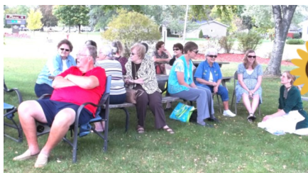
Enjoying the great weather!

All the money raised at the pie auction is going to be donated to Camp Phillip's building fund. Thanks to the generosity of everyone at the fair, we raised $377.50 to donate to Camp Phillip!! Thanks to all who participated in the fun!