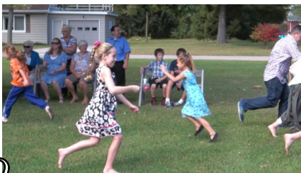
Sierra at the potato races