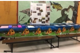
Our booth at Blue Ribbon kids’ Day.

On Saturday, April 1, the Peace Lutheran Pioneers had a booth at Blue Ribbon Kids’ Day, an annual community event for children and their families, at Park-side Middle School.