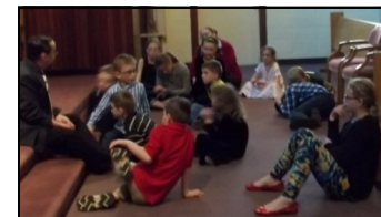
All the kids with Pastor

What a privilege it is to see the Holy Spirit at work! Thanks to all who came and to all our workers!