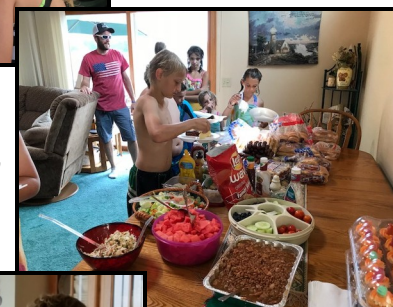
Look at all that food!