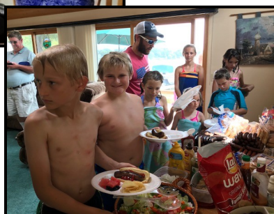
Loading up their plates.