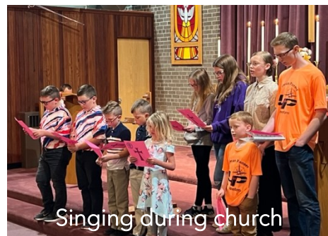
Singing during church

Thank you to our congregation for realizing the incredible benefits our church reaps with an active Pioneers ministry. We appreciate your support!