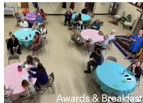
Awards & Breakfast