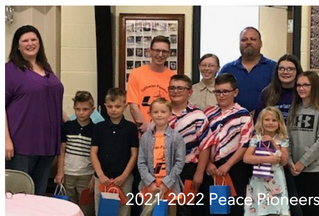
2021-2022 Peace Pioneers