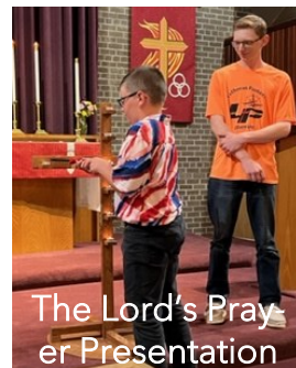
The Lord's Prayer Presentation